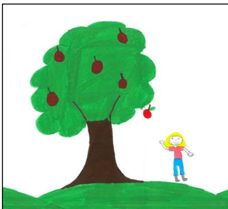
Figure 1. PPAT with partially active person who does not touch the tree. Tree inclining slightly away from the person, with six apples equally distributed.

Data analysis shows that the common drawing for this sample includes a tree with an equal amount of strength and weakness, with five to six apples equally distributed. The tree inclines slightly away from the person, although the branches are neutrally placed in regard to the person's position and are accessible from both sides of the tree. The person is shorter than the tree (about 1:3), partially active in the picking process, and is not touching the tree. An example for the common drawing can be seen in Figure 1.