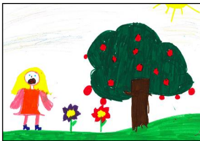
Figure 2. Cluster A PPAT with a potent and neutral tree in terms of accessibility, and a person with low agency.